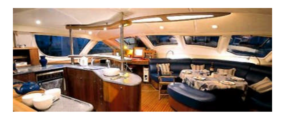
Saloon and Galley

Extremely spacious, with an immense saloon, a fully equipped American style galley a 35m2 deck salon plus trampoline nets. Agape is the largest and most exclusive cat available for charter in the South Pacific .